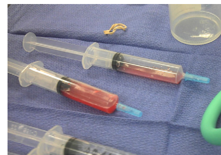
FIGURE 2 BAL fluid was grossly bloody.

The differential diagnosis of DAH is broad. Autoimmune conditions