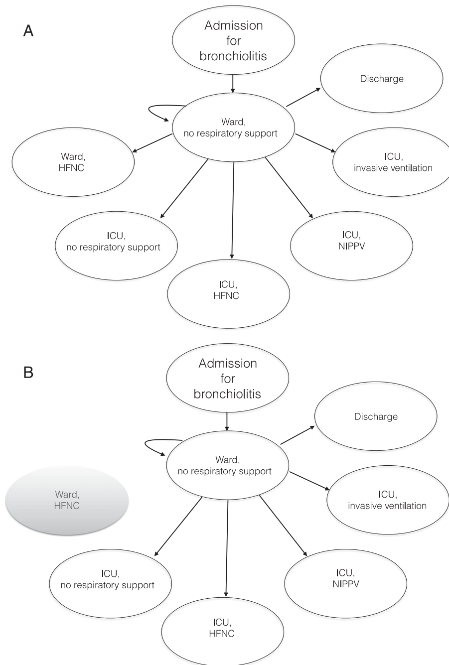
FIGURE 1 Simplified Markov diagram of a patient admitted to the ward with no respiratory support. A, An example of a patient admitted to the ward, no respiratory support branch with the available transitions for the Ward HFNC branch. B, An example of a patient admitted to the ward, no respiratory support branch with the available transitions for the ICU HFNC branch.

support) for the non-ICU branches of our ward HFNC branch were derived from postpathway cohort admission data, in which the frequency of admission to each state is equivalent to the initial probability for each state. All ICU branch initial probabilities, not including HFNC in the ICU,